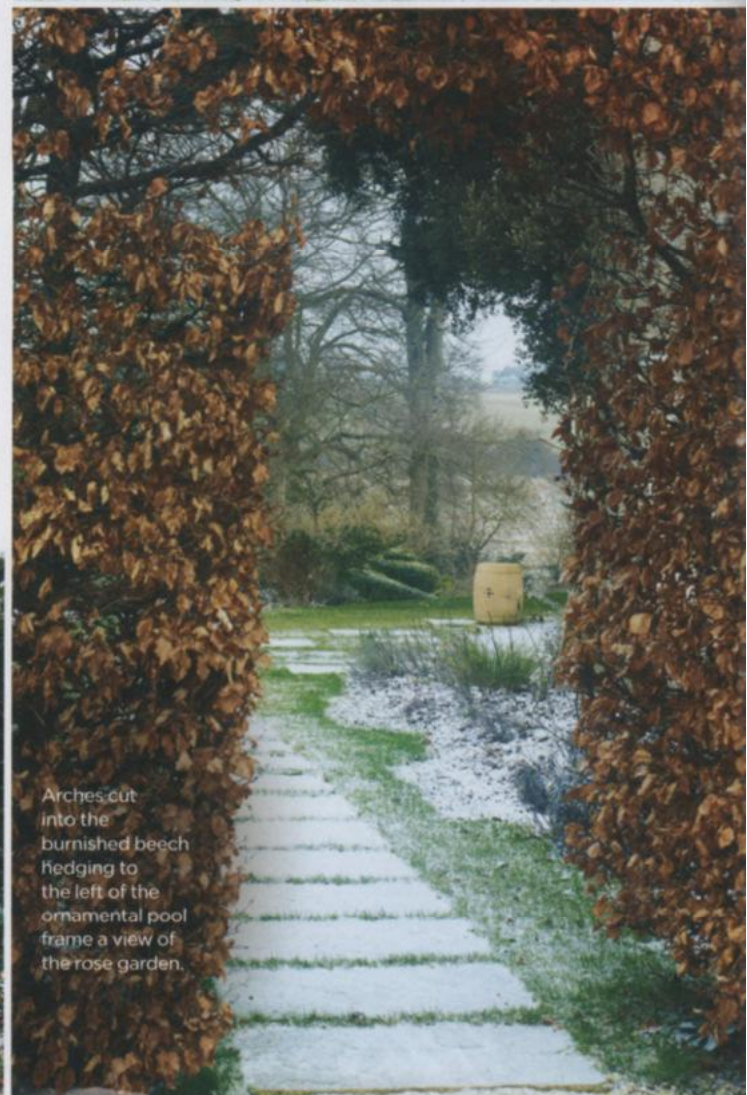
Arches cut into the burnished beech hedging to the left of the ornamental pool frame a view of the rose garden.