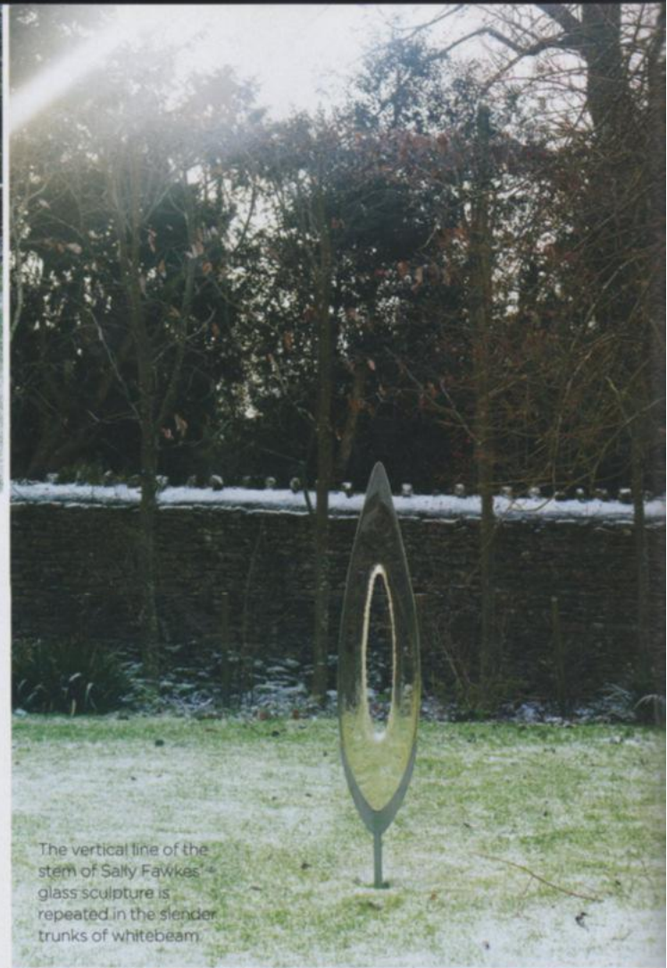
The vertical line of the stem of Sally Fawkes' glass sculpture is repeated in the slender trunks of whitebeam.

The different areas are linked, flowing on from one another and making the two-acre garden seem larger. Each sculpture reflects its setting: strong, architectural shapes and bold figures are placed in formal areas near the house and along the grass terraces, while in the meadow the sculptures are more elemental, emerging apparently organically. "It's a quiet garden," says Richard, "with a great feeling of serenity." That is never more true than on a winter's day, when the silence seems absolute. ■