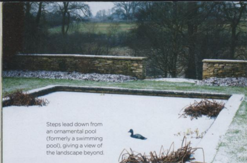
Steps lead down from an ornamental pool (formerly a swimming pool), giving a view of the landscape beyond.

affair. Here, bronze acrobats now turn somersaults amid box-edged beds filled in summer with 'Moonlight' and 'Yvonne Rabier' roses, astrantias, Viola cornuta , willow gentian and alliums.